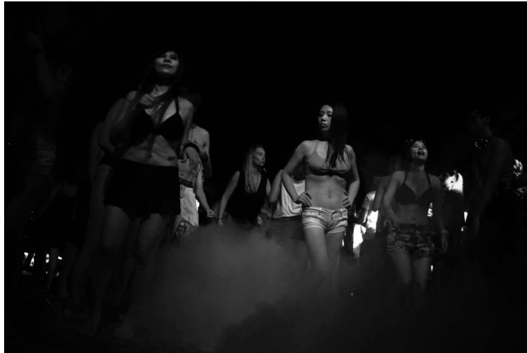
Would the "strawberry generation" only live for entertainment? A student / pool party in 2014.

But Taiwan's millennium generation, born after 1981, has grown up in a wealthy and peaceful environment free of political oppression. The difference with older generations was enormous, to such an extent that this generation (the "Y generation" in Europe) was called the "Strawberry Generation." The "Strawberry Generation" is a Mandarin language neologism for Taiwanese youth who would "bruise easily" like strawberries, meaning that they would not be able to withstand social pressure nor work hard like their parents' generation 1 . More generally, the term refers to Taiwan's youth, perceived as insubordinate, selfish, arrogant, and sluggish when working.