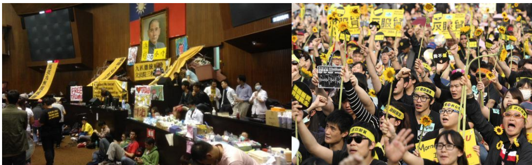
Student occupation of the Legislative Yuan, March 2014, source: Lemonde.fr

Young Taiwanese have grown-up in a fully democratic Taiwan and massively reject the unification with China. In addition, after the Hong Kong experience, the opposition to the “One country – Two systems” formula has also strengthened. As a result, young Taiwanese decided to oppose the Ma Ying-jeou China leaning policies, which were seen as a risk towards delivering Taiwan into the arms of China.