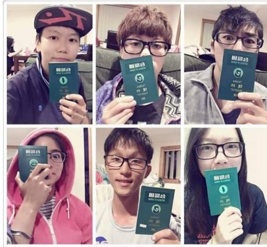
"Republic of Taiwan" stickers on passport, an initiative of the youth