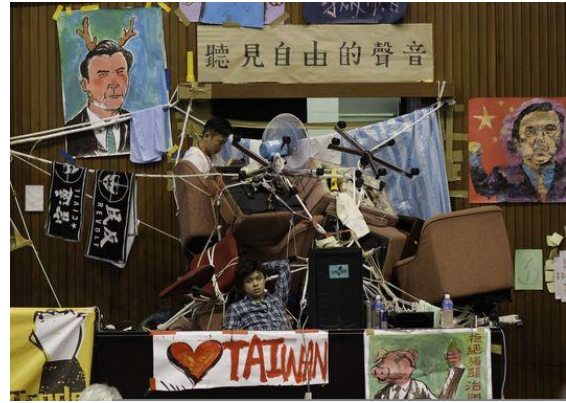
A caricature of former President Ma Ying-jeou inside the occupied Legislative Yuan, March 2014, source: Lemonde.fr

Young Taiwanese protesters also wanted their movement to stand the test of time. On March 30, 2014, a mass demonstration occurred in front of Taipei's Presidential Palace. Meanwhile, inside the occupied Legislative Yuan, walls were covered with portraits of President Ma Ying-jeou. In April 2014, the students obtained the suspension of the CSSTA and the treaty remains unratified by the Taiwanese legislature. The KMT was heavily sanctioned by the voters in the fall 2014 local elections 40 .